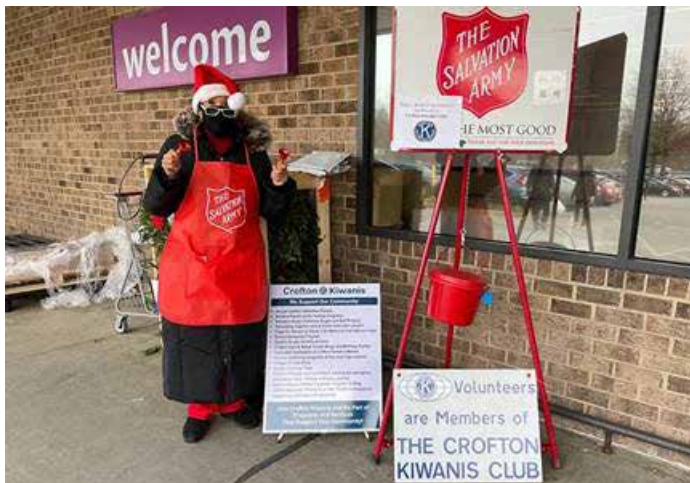
Kiwanis Club of Crofton