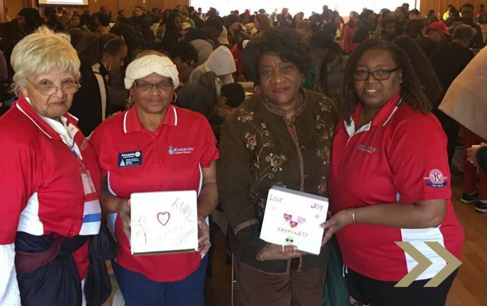
COVER & ABOVE: Members of Eastern Branch and Far East clubs with 700+ volunteers at MLK Day of Service assembling meal, dental and feminine hygiene kits in Silver Spring and painting murals at Ludlow Taylor Elementary School.