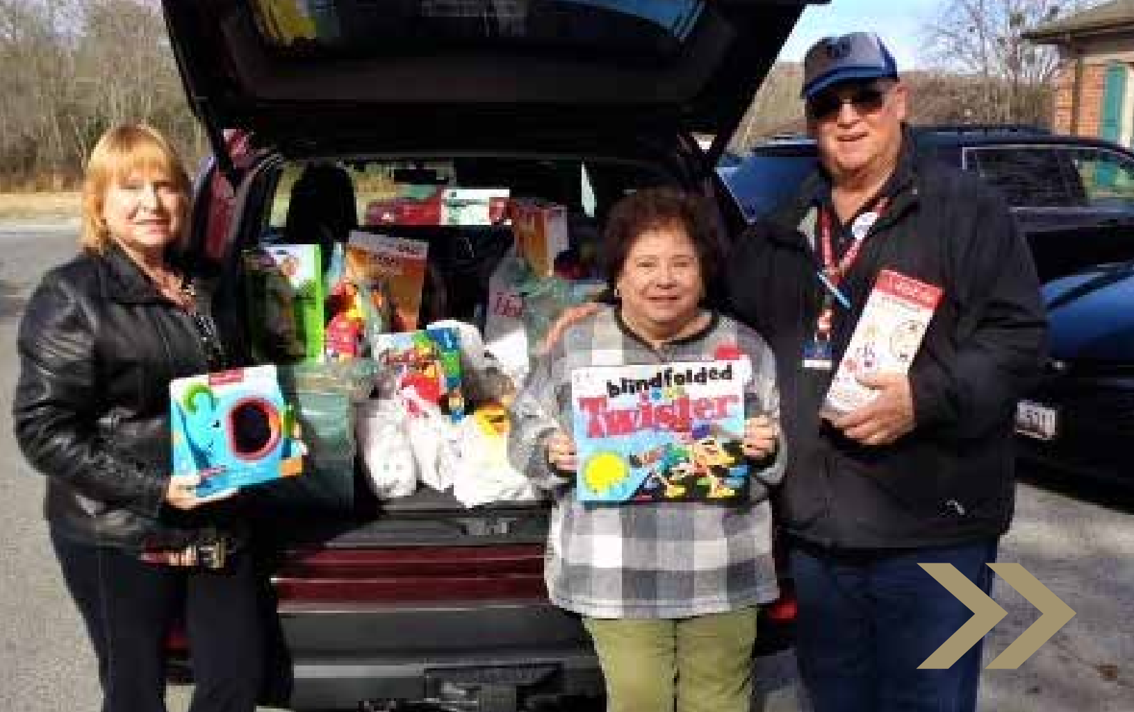
Kiwanis Club of Ocean Pines-Ocean City delivers toys to children in need.