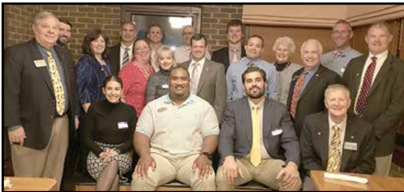
“Forest” Club - Division 15 Sponsored by Lynchburg Club