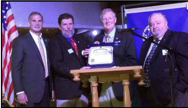
“St. Paul - Castlewood, VA” - Division 17

Sponsored by Wise, Norton, & Coeburn Clubs