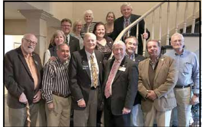
“Smith Mountain Lake” - Division 15

Sponsored by Wise, Norton, & Coeburn Clubs