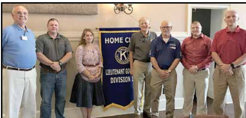
Newly Organized “Chilhowie, VA” - Division 16 Sponsored by Abingdon & Marion Clubs