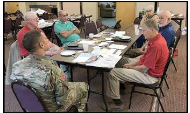
“Orange, VA” - Division 9 Sponsored by Richmond & Harrisonburg Clubs