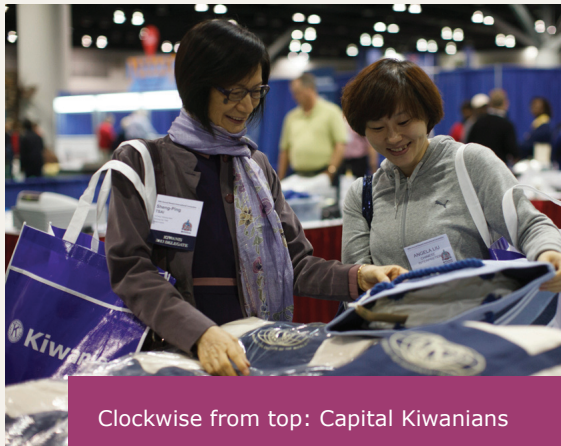
Clockwise from top: Capital Kiwanians prepare to walk for The Eliminate Project; Kiwanians view merchandise in the Kiwanis Store; Capital District CKI members; Kiwanians enjoyed the Midtown Men.