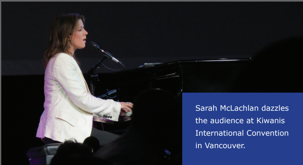
Sarah McLachlan dazzles the audience at Kiwanis International Convention in Vancouver.

"You're in the arms of the Angel, may you find some comfort here", Sarah concludes her hit song "Angel". She stood up, clasped her hands together and humbly bowed to her standing audience, kissed her World Service Medal, touched her heart and bowed to us again. How genuine, how humble, how Kiwanis- Wow!! Thank YOU Sarah, not only for your talent and generous heart, but for remembering your roots, your humble beginnings and for re-kindling the long-ago memory which was, unknowingly, MY first Kiwanis moment.