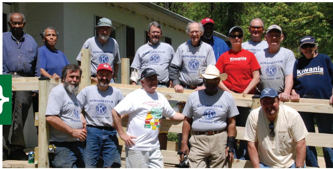
The Waldorf Kiwanis Club's "Rampsters" team.

As their Christmas in April community service project on April 27, 2013, the Kiwanis Club of Waldorf built a handicap ramp for an elderly family in Charles County. The Club's "Rampsters" team builds ramps throughout the year, partnering with Christmas in April and the Southern Maryland Center for Independent Living.