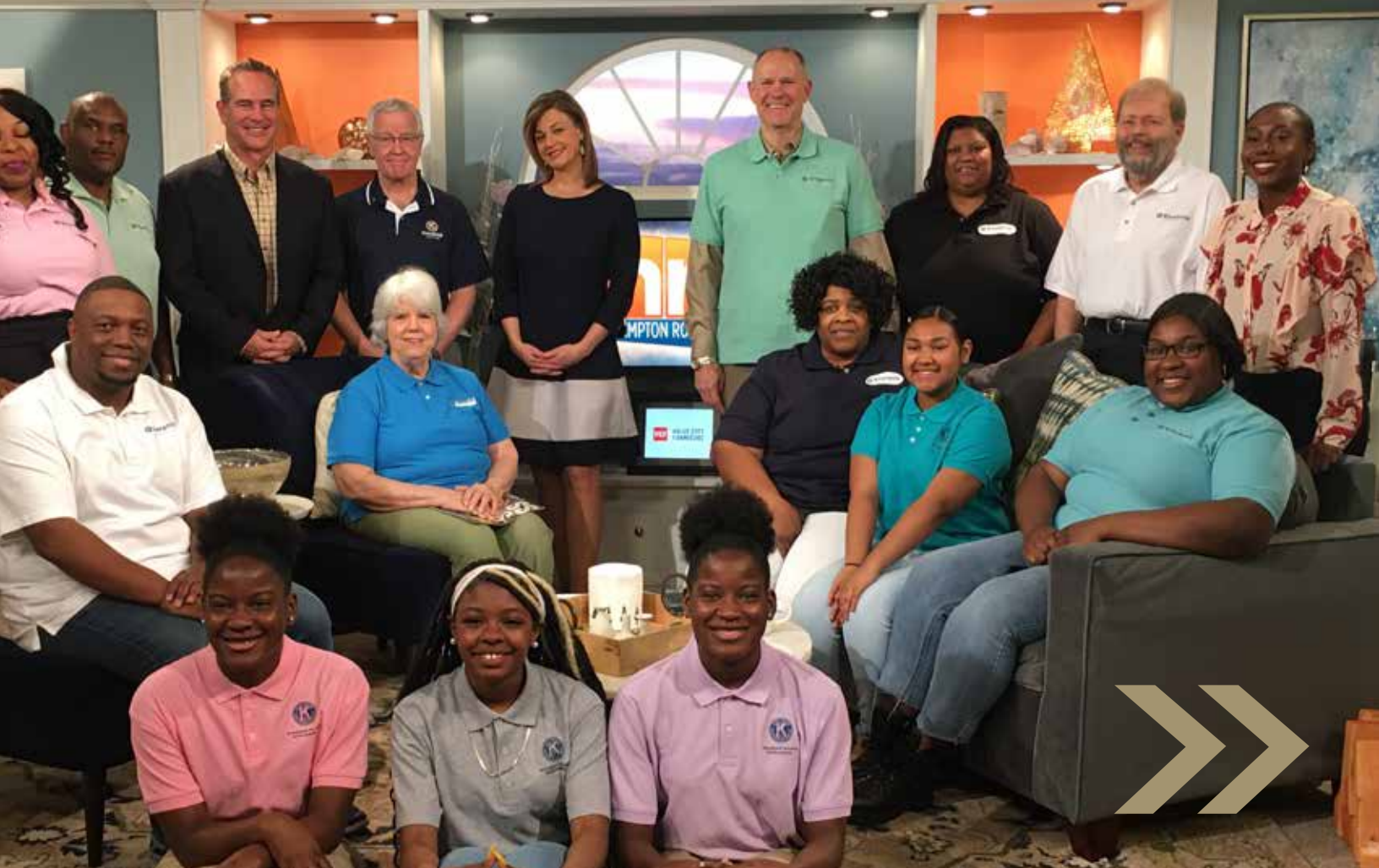
COVER: Kiwanis Club of Middlesex helps with meal packing efforts for families in need during the pandemic; ABOVE: The Kiwanis Club of Portsmouth was featured as the live audience on the NBC station in Portsmouth, Virginia 's Hampton Roads Show on March 11th.